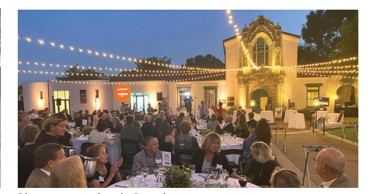
Dinner was served on the Depot lawn