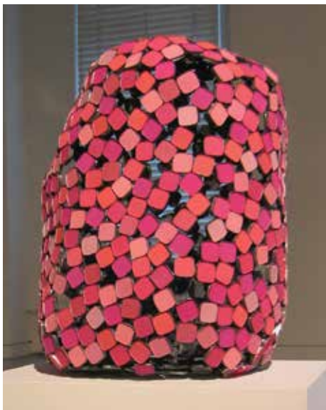
Top: June Harwood, Blue Oyster Cult , 1977, Rock Series, Acrylic on Canvas